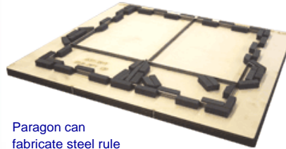
Paragon can fabricate steel rule dies for large roller presses with a 2" maximum rule height.